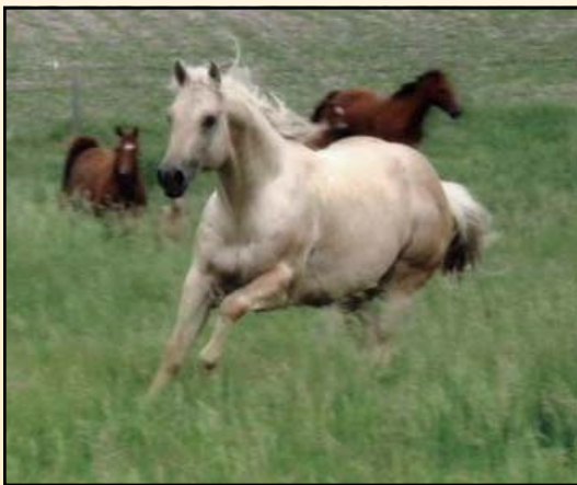
CHIQUITAS LAST PARR "Charlie" 1999 Palomino Stallion

Our goal has been, and will continue to be, to produce all-around performance horses with style and eye appeal.